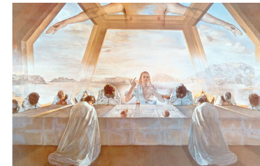
Dalí's The Sacrament of the Last Supper (1955)

In 1567 Thomas Tallis contributed nine tunes for a collection of vernacular psalm settings intended for publication in a metrical psalter then being compiled for the (first Anglican) Archbishop of Canterbury, Matthew Parker. The Third Tune rendered Psalm 2. It has two settings in The Hymnal 1982 , #170 “To mock your reign, O dearest Lord” and #692 “I heard the voice of Jesus say.” It is also the basis of the Ralph Vaughan Williams 1910 work for string orchestra, Fantasia on a Theme by Thomas Tallis .