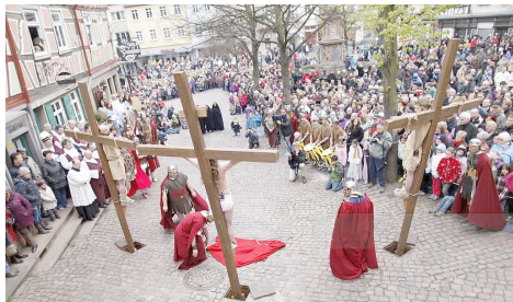
A modern enactment of the crucifixion.

Anglicans defended the moral fiction of the Elizabethan stage against the Puritans. Anglican poet Samuel Taylor Coleridge said the enjoyment of fiction arises from a “willing suspension of disbelief.” How far is this from describing PostModernism as “incredulity toward meta-narratives”? (Jean-François Lyotard)