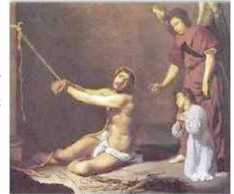
Christ after the Flagellation contemplated by the Christian Soul (1628) by Diego Velázquez

3. Is Christ simply an historical figure or does He live within us, and us within Him?